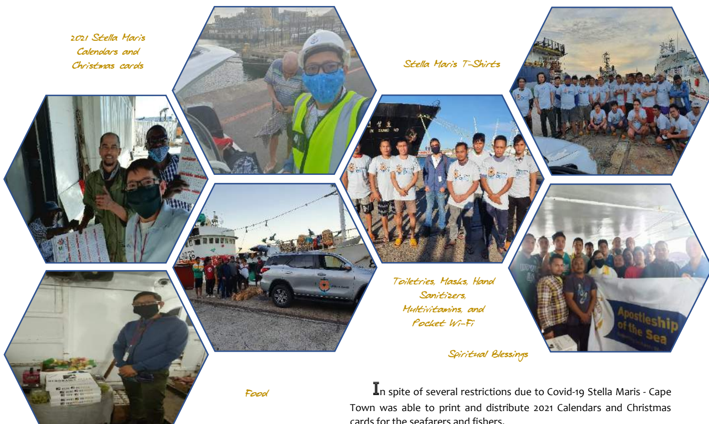
2021 Stella Maris Calendars and Christmas cards