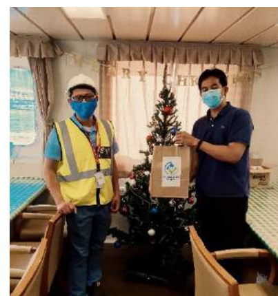
Pict 05. Allowed to enter even inside the crew mess room.

Requests: It is worth mentioning here that some seafarers requested visits to the Seafarers Centre or the Duty Free Shop, which required transport for them. Three seafarers requested souvenir items to be included in their gift bags. Two, requested personal items. Aware of the strict Covid-19 protocols, Fr Talisic had to unfortunately decline on their requests so as to avoid the danger of contamination.