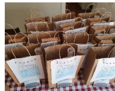
Pict 01. Christmas gift bags for the seafarers.