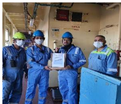
Pict 04. Allowed to get on board until the deck.

Requests: It is worth mentioning here that some seafarers requested visits to the Seafarers Centre or the Duty Free Shop, which required transport for them. Three seafarers requested souvenir items to be included in their gift bags. Two, requested personal items. Aware of the strict Covid-19 protocols, Fr Talisic had to unfortunately decline on their requests so as to avoid the danger of contamination.