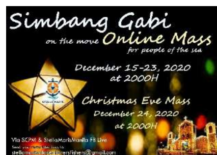
Pict 07. Online Mass invitation ads/card to seafarers and their families.